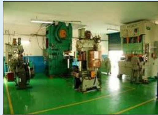
➤ Fully Automated Press Shop