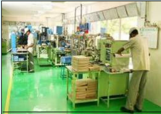
➤ Thermostat Assembly Cell Single Piece Flow