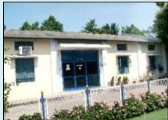
➤ Dedicated Design and Testing Facility