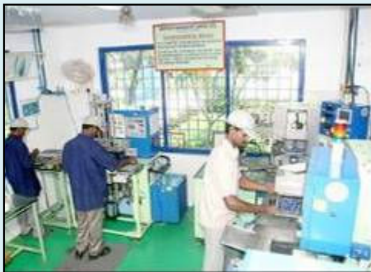
➤ Sensor Assembly Cell